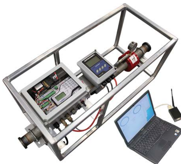
Specifications may change without notice. MIB0045D